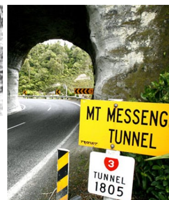
Present day >